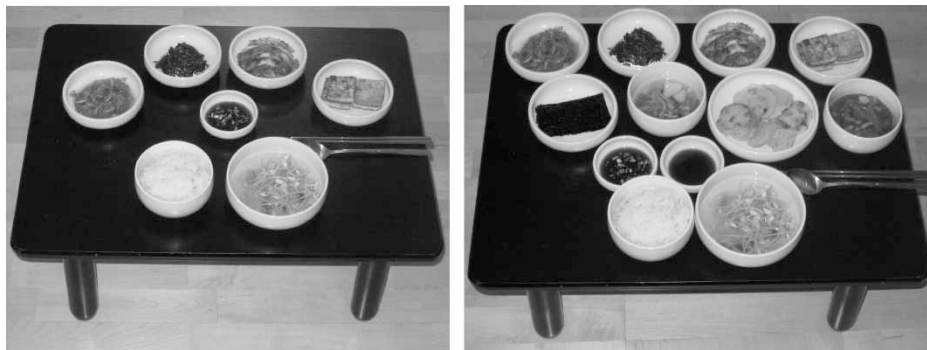
Figure 2. Three-chop (left) and five-chop (right) meal tables. Author’s own cooking and photography, based on Korean cookbooks and textbooks. 40

A three-dish meal ( sam-chop bansang ) 39 is, for example, a typically modest but well-balanced ordinary meal, which includes one fresh marinated vegetable dish, one blanched and seasoned vegetable dish, and one baked or broiled dish (usually seafood or meat), in addition to the basic necessities of rice, soup, kimchi and little bowls of sauces. A five-dish meal ( o-chop bansang ) is a more elaborate ordinary meal, with a pan-fried vegetable or fish cutlet, and a dried food or preserved seafood dish added to the three-dish meal. A nine-dish meal is a formal feast,