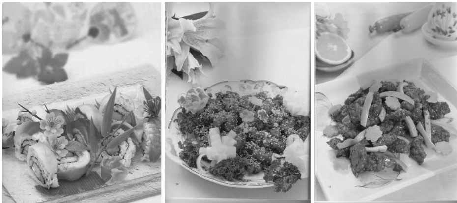
Figure 1. Vignettes of Korean cooking. 37

What is ironic is the emphasis on authenticity in English language cookbooks that are unfaithful to the culinary traditions of the country of origin in every aspect—in cooking methods, in the choice of materials, and in the visual presentation of final products. Whether the authenticity is established by what Koreans in Korea do (practices) or what Koreans in Korea believe (norms), the cookbooks all fail the test; albeit there is a wide variation in the extent of failure. The very fact that authenticity is a central issue reflects a key characteristic of diaphora—a constant search for identity in relation to the homeland. Many Korean American cookbook authors and commentators emphatically assert their wish for the cookbooks to help their own daughters or the second generation in general appreciate and maintain “Korean” culture. Paradoxically, what these cookbooks accomplish is the creation and dissemination of hybrid cuisines instead of traditional Korean cuisines.